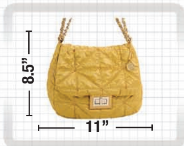
BAGS NO LARGER THAN 8.5" x 11"