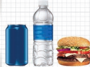
NO FOOD OR BEVERAGES