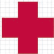
ITEMS RELATED TO A MEDICAL CONDITION