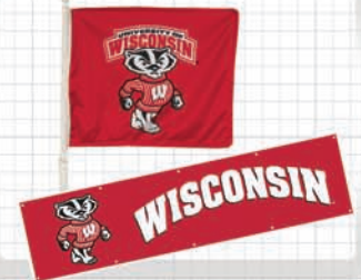
NO FLAGS, BANNERS, SIGNS