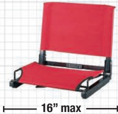
CHAIRBACKS not more than 16" wide