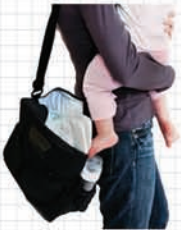
DIAPER BAGS WITH CHILD