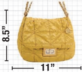
BAGS NO LARGER THAN 8.5" x 11"