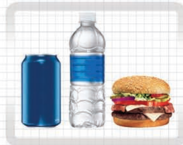
NO FOOD OR BEVERAGES