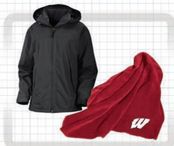
JACKETS & BLANKETS