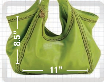
NO BAGS LARGER THAN 8.5" x 11"