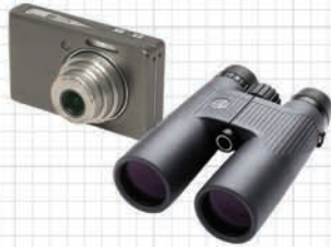
BINOCULARS & CAMERAS