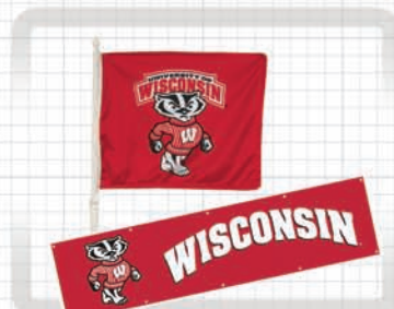
NO FLAGS, BANNERS, SIGNS