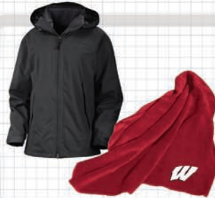
JACKETS & BLANKETS