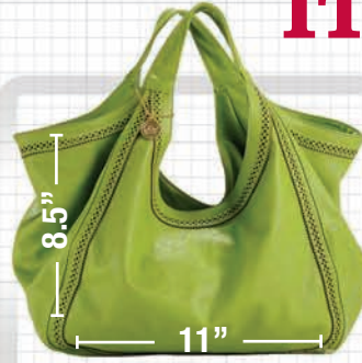
NO BAGS LARGER THAN 8.5" x 11"