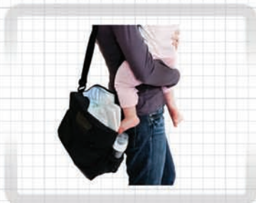
DIAPER BAGS WITH CHILD