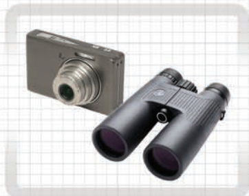
BINOCULARS & CAMERAS